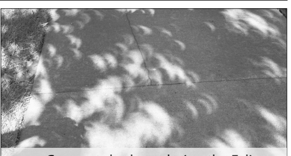
Crescent shadows during the Eclipse

Arborist Tree Inventory Presentation... Approved a town hall presentation by Village Green consulting arborist Cy Carlberg to share the results of the Tree Inventory Report. \Box