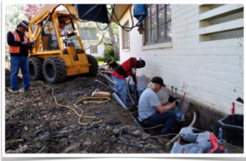
STABILIZATION WORK IN FULL SWING: Workers installing helical piers on Building 8 in Court 2 on February 24.