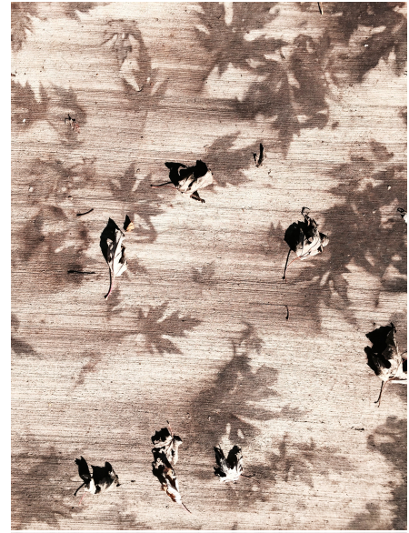
A sidewalk work of art: natural impressions left by leaves.