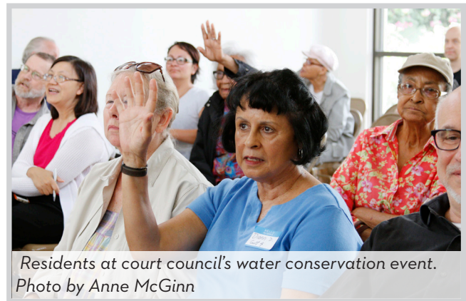
Residents at court council's water conservation event.

More of L.A.'s water will come from expanding use of recycled water, groundwater, and stormwater. Pipes need to be replaced to reduce wasteful leaks. Residents and