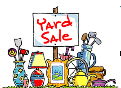
VILLAGE GREEN YARD SALE

Green, he informally monitors the homeless situation on our perimeters and stays in touch with LAPD officers. \Box