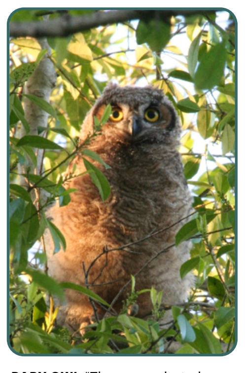
BABY OWL "The crows alerted me that this taloned fluff was in a small tree just outside our door." Karen Bragg, 4/21/23, Court 14