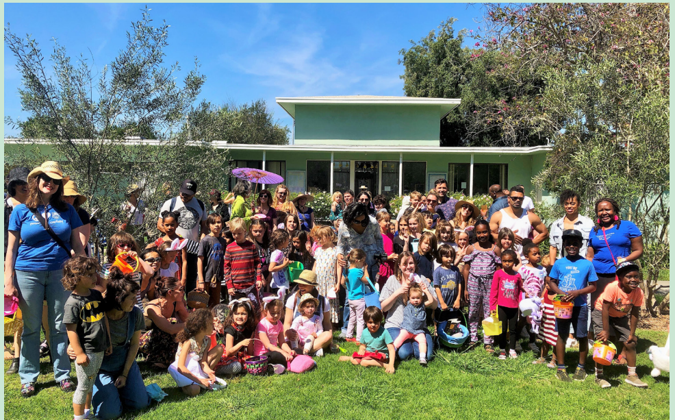
Easter Egg Hunt participants.

painting, and carpentry. Insulation meetings with owners and tenants are scheduled for May 2 and 4, with work to begin soon after.