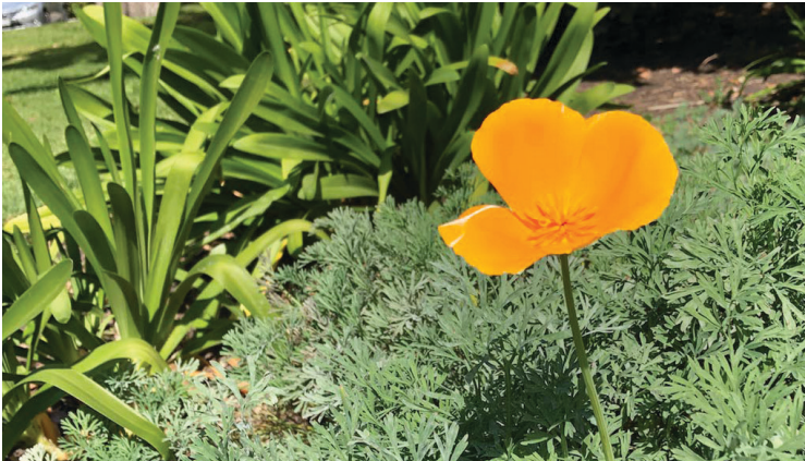
First poppy of the season for the bed west of the Clubhouse parking lot.

The Phase 1 electrical contractor has finished surveying and mapping our existing electrical infrastructure and is now completing the single-line building diagrams required for a DWP upgrade plan. A meeting with the company is scheduled for early March. To review the three-phase plan, see HIGHLIGHTS December, January, and February issues at www.villagegreenla.net .