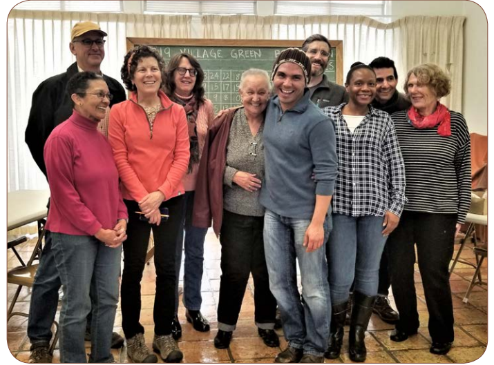
2019's Ballot Counters

We had a smooth election this year. Thank you for your help making the election successful. A special thank you to those who helped with the ballot counting.