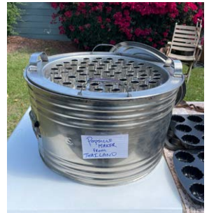
the 'Thai popsicle' device