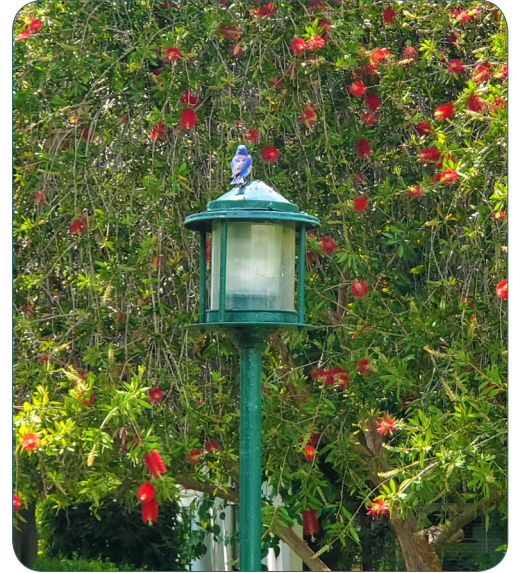
Court 5-6.