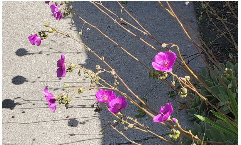
Two lovely landscapes in narrow beds on the Obama side of the Green