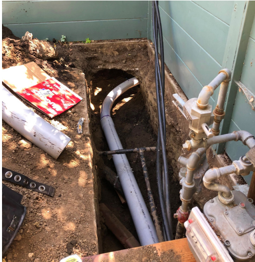
Conduit entering Court 6 patio containing the electrical junction box.

Court 6 residents' long wait is almost over! All the underground work is complete and approved, and the new walkway is to be finished this month. Following that, LADWP will install the new underground feed lines and remove the overhead lines that have been there since December 2019.