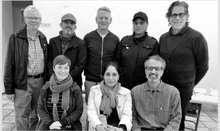
2019 Board of Directors

Next month's newsletter will carry more election and Annual Meeting news. □