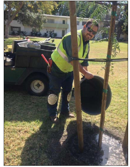
GreenCrew worker feeds vitamin water to Pepper

The Tree Committee is now developing other projects, including shade tree plantings. The committee meets on the second Tuesday of the month at 7:00pm and welcomes guests and potential members. □