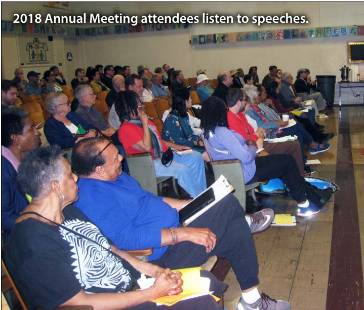
2018 Annual Meeting attendees listen to speeches.