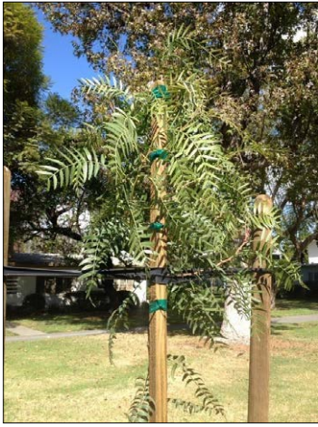
Newly planted California Pepper

Congratulations, Village Green. 20 trees approved by the Board last June for the East Green are finally in the ground! They have already begun to add beauty to the area and are a testament to the VGOA's commitment to preserve and in some cases restore our historically significant features.