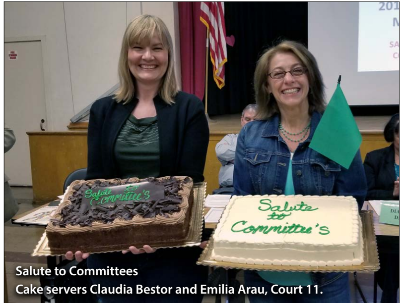
Salute to Committees