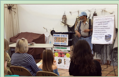
People of all ages attended the composting workshop.

Twenty-five "Greenies" attended a November "Smart Gardening" presentation by the LA County Department of Public Works with tips on how to improve a garden and reduce waste. The event was sponsored by the landscape committee.