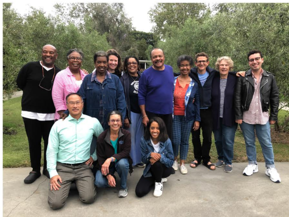
Court Council reps and alternates pose for their web page photo.