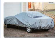
Covers or tarps on boats, cars or recreational vehicles