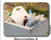
Recyclables & recycle collection bins