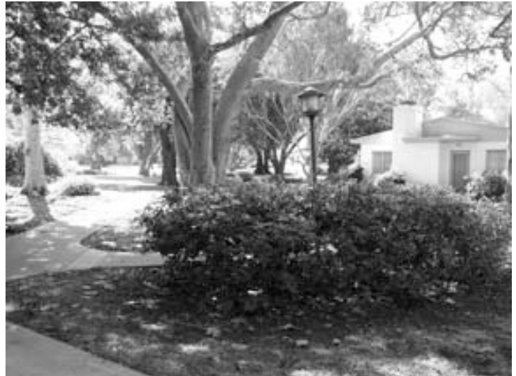
The Village Green, circa 2006

Village Green Highlights is the community newsletter of the Village Green Owners Association, incorporated August 8, 1973. We make every attempt to ensure the accuracy of all information. However, we are not responsible for errors, omissions, or inaccuracies in this publication. The editor reserves the right to edit articles and letters for tone, clarity and length. Opinions expressed in Highlights do not necessarily reflect the opinions of the Board of Directors or the Management. Please submit submissions or comments to the editor at vghighlights@yahoo.com , or to the office.