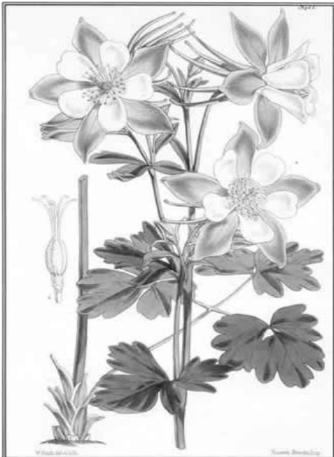
The Rocky Mountain columbine

the sword fern, which is invasive and can become out-of-control because it reproduces quickly. Ferns love our climate and do not mind the invasive roots of trees. They will survive with very little water and there are many, many types available. They also do well in pots.