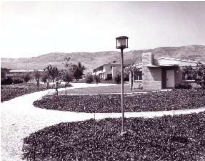
The Village Green (known then as Baldwin Hills Village), circa 1942