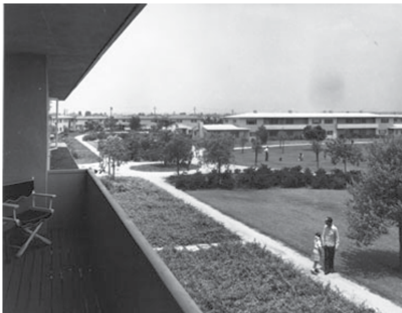
A view of the Green from a balcony, 1941.

* Some Village Green units are equipped with older manual timers that control patio lighting. A handout with instructions about programming manual Intermatic and General Electric timers is available at the office.