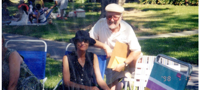
Residents enjoy a summer concert sponsored by the Cultural Affairs Committee in 1995

One of the longest established committees on the Green, the Cultural Affairs Committee is committed to sponsoring events that get residents out of their units, meeting each other and celebrating life here. The events they plan are at the core of what makes the Village Green a unique place to live. The committee strives to offer a variety of events to appeal to the diverse VG residences. If one event doesn't appeal to you, another certainly will.