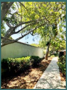
No more overhead wires!