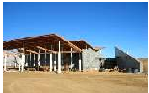
Planned Park with a View